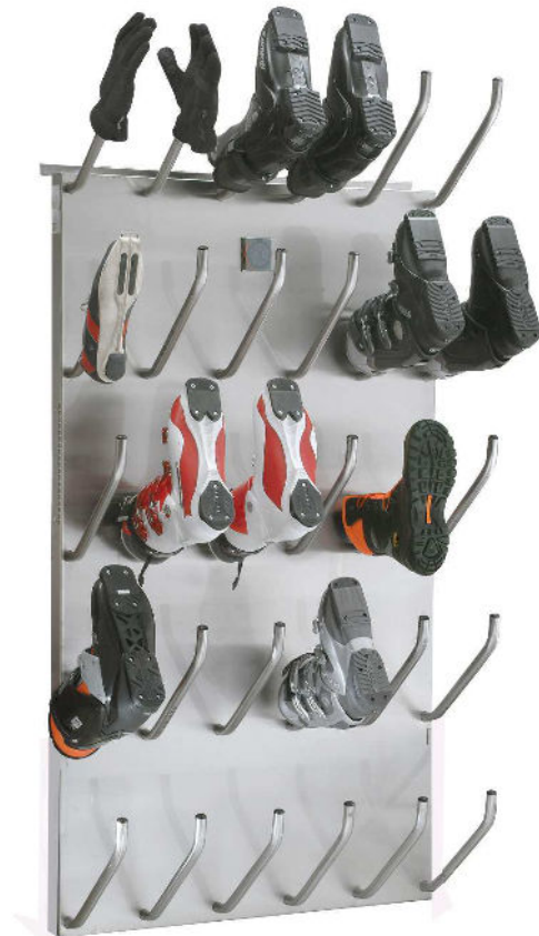
sample picture: Warm 15 for 15 pairs of shoes and boots