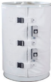
Drum heaters for food stuff